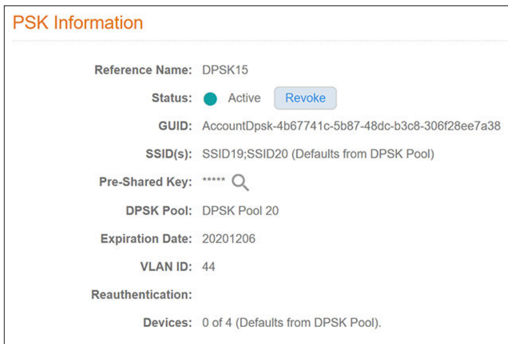
FIGURE 2 DPSK15 Information in UI After API PUT Call

You can go to the UI to confirm that the DPSK was edited correctly. The values should match those in the Response body from the PUT. For example, you can see that the SSID list no longer has any restrictions, and that the VLAN ID has been changed to 44.